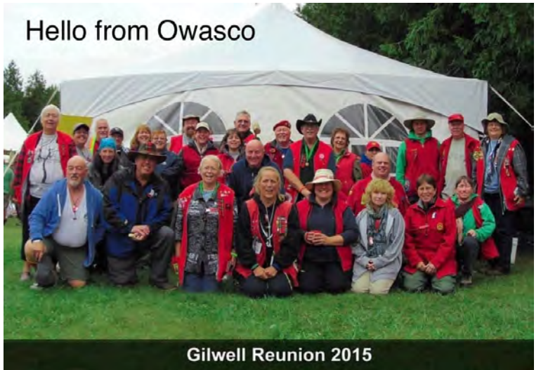
Gilwell Reunion 2015