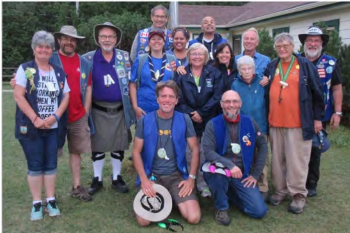
Hello from North Waterloo